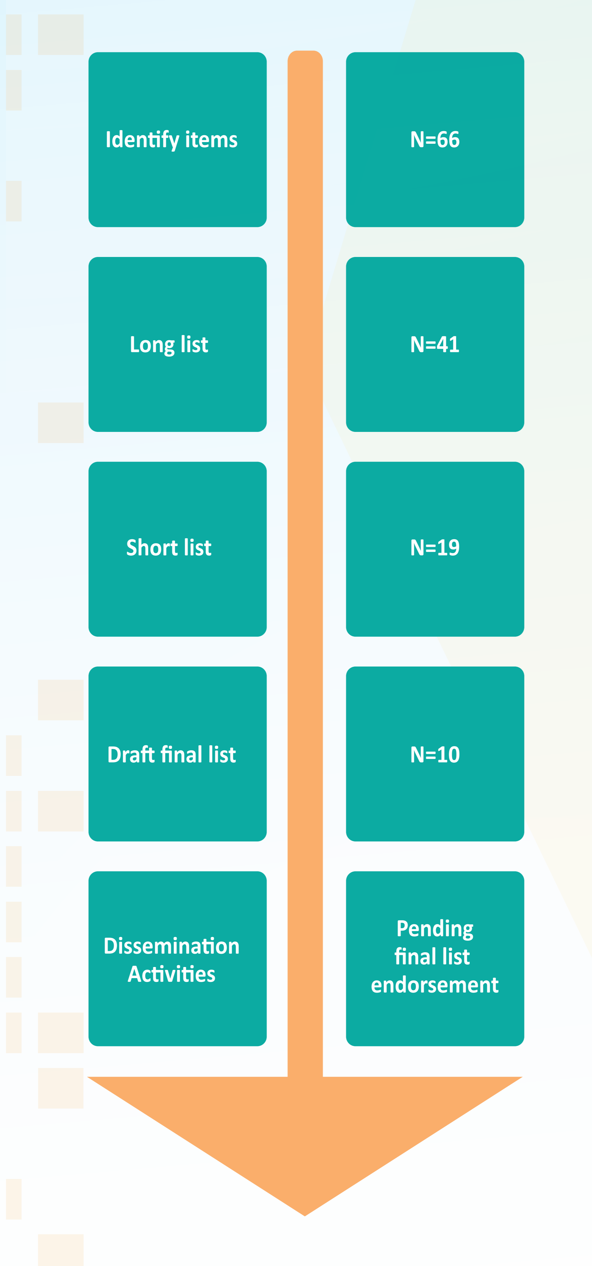
Figure 2: Choosing Wisely Canada® Cancer Process